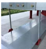
Hanging brackets standard for clean appearance