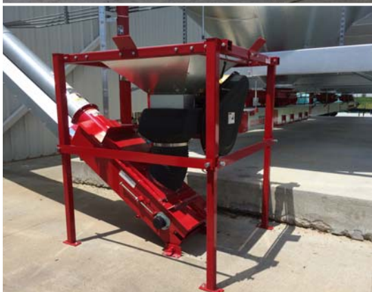
16UB Enclosed Transition w/ Optional Seed Box Hopper