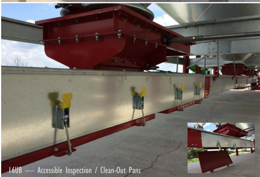
16UB — Accessible Inspection / Clean-Out Pans