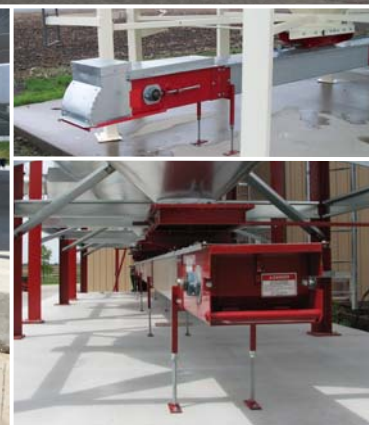
Model 12UB Conveyor